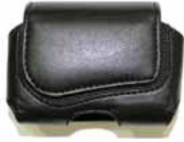
Black Leatherette Case